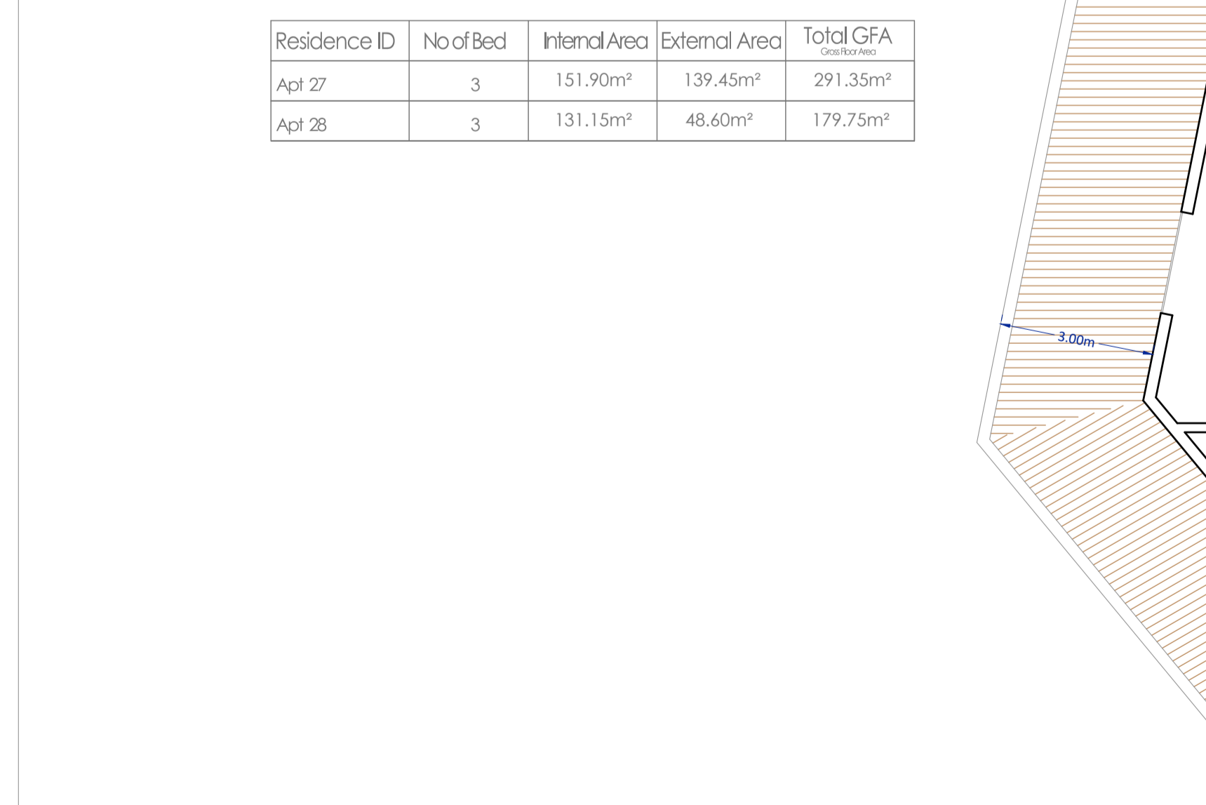
Proposed Third Floor Level scale 1:100